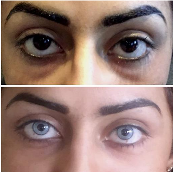
Fig. 2. Esthetic aspect before (top) and 8 months after (bottom) the procedure.